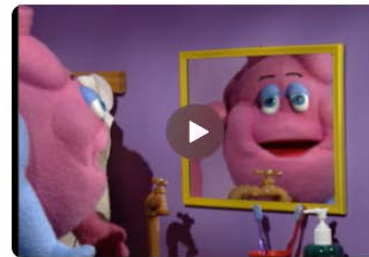
WASH YOUR HANDS.MP4

SHORTS! BY TOPIC 80 1-minute videos - great for transition time