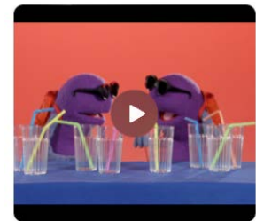
DRINK YOUR WATER.MP4

Note: To promote drinking water and staying hydrated while exercising, you can add/replace one of the above videos with this Drink Your Water Short .