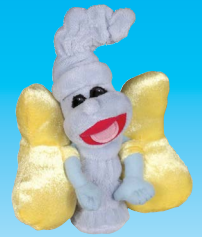
Windy® (the lungs)