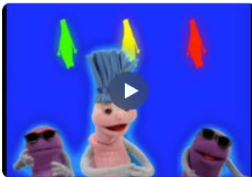
KEEP YOUR MUSCLES MOVING.MP4